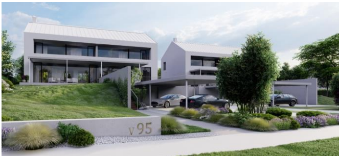
VILLAS VYSOKÝ ÚJEZD

Selection of currently running residential projects