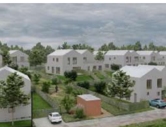
LIBČICE NAD VLTAVOU