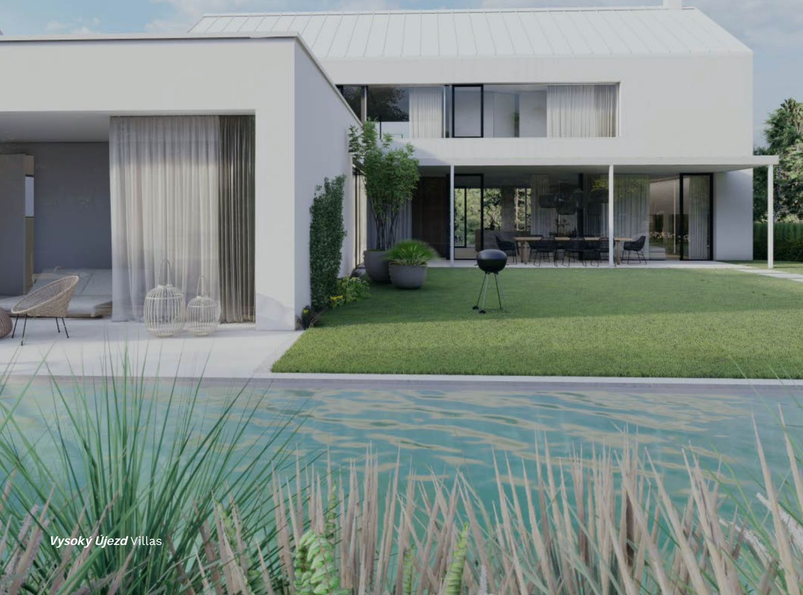
Vysoký Újezd Villas